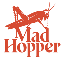
WITHOUT BREWING CO.