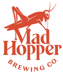
WITHOUT EST. 2021